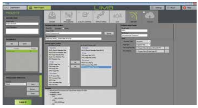
Multiple export settings