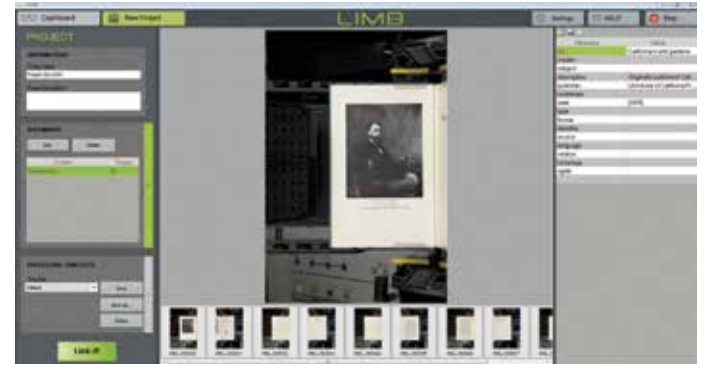
New Project Structuring