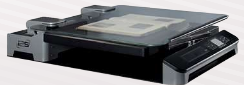
Motorized Book Cradle