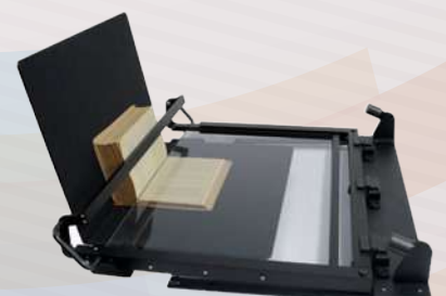
V-Shape Book Holder